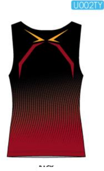
Youth Girls and Adult Women