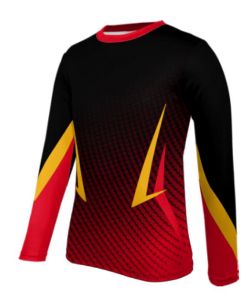
SKU: U265TU | Color: Chaos