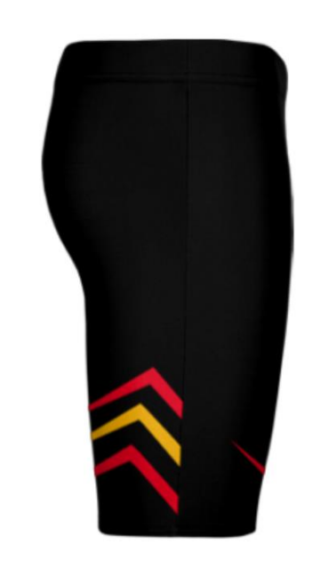
SKU: U002BU | Color: Chaos